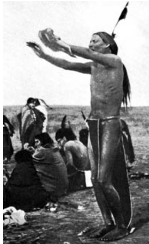
The Ghost Dance—Rigid stance

This publication is available for download in Adobe Acrobat PDF format from the following ODL web page: www.odl.state.ok.us/usinfo/topiclists/us-native.htm