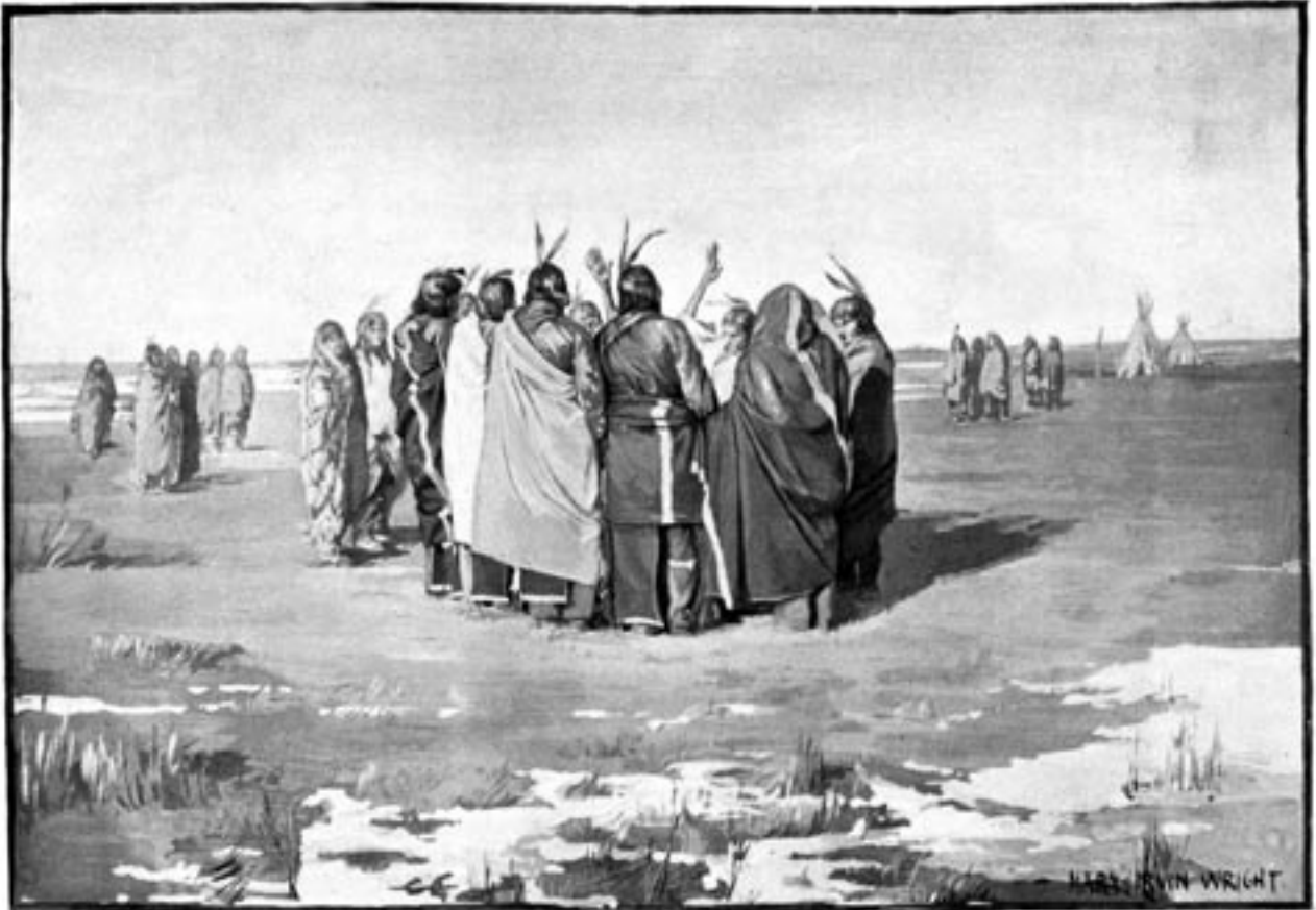
THE GHOST DANCE—SMALL CIRCLE