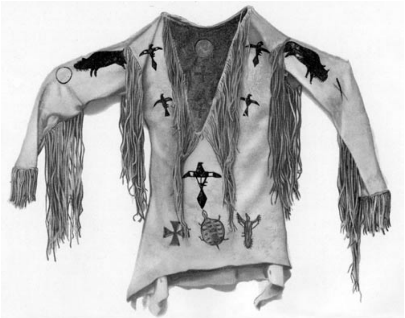
Arapaho Ghost Shirt