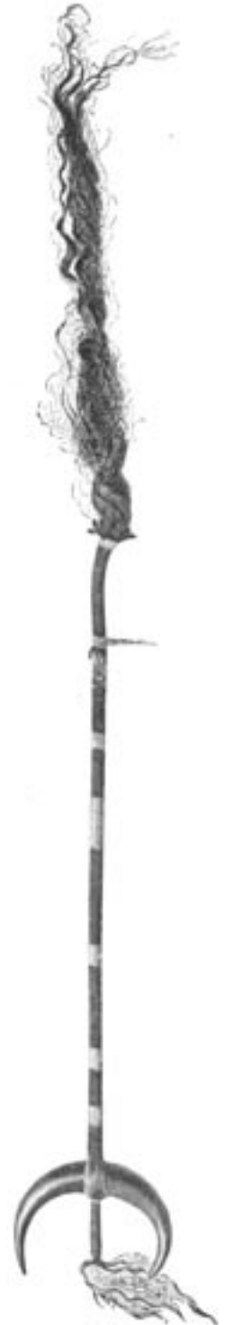
Staff. Sacred object from the Sioux Ghost Dance.

East Central University Library Metropolitan Library System Northeastern State University Library Northwestern Oklahoma State University Library Oklahoma Department of Libraries USGID, Oklahoma Collection Oklahoma State University Library DD Southeastern Oklahoma State University Library University of Central Oklahoma Library University of Oklahoma Library GDC University of Oklahoma Law Library University of Tulsa Law Library University of Tulsa McFarlin Library Tulsa City-County Library