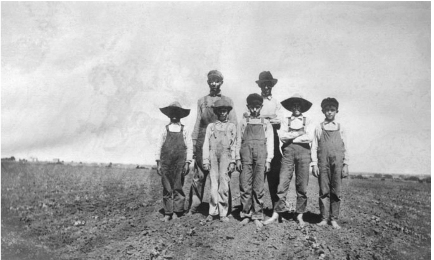
Group meeting of Boys Corn and Cotton Club, Oklahoma City, Oklahoma. (May 26, 1913)