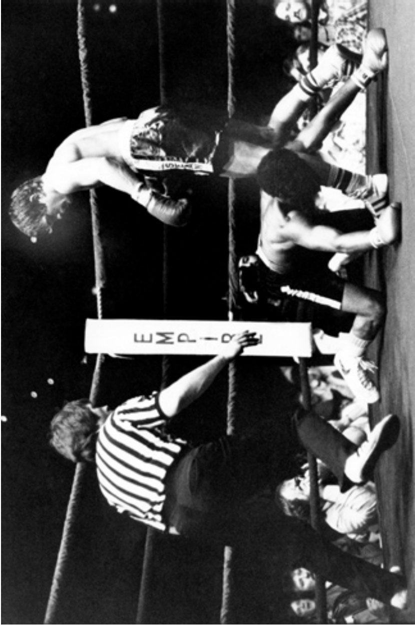
Sean O'Grady begins to walk away after landing his final punch to technically knock out Sultan Saladin during the fourth round of the fight held at the Myriad, in Oklahoma City on February 9, 1982. O'Grady had a record of 81 wins and 5 losses as a professional boxer, with 70 wins by knockout, making him a member of the exclusive group of boxers with 50 or more career knockout wins.