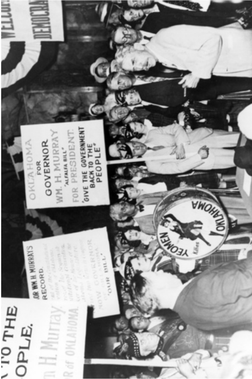
An Oklahoman tries out for the big league—the Yeomen of the Kilties band joins Governor William “Alfafa Bill” Murray in Chicago at the 1932 Democratic National Convention, where he was a favorite son candidate for the presidential nomination, using the platform “bread, butter, bacon and beans.”