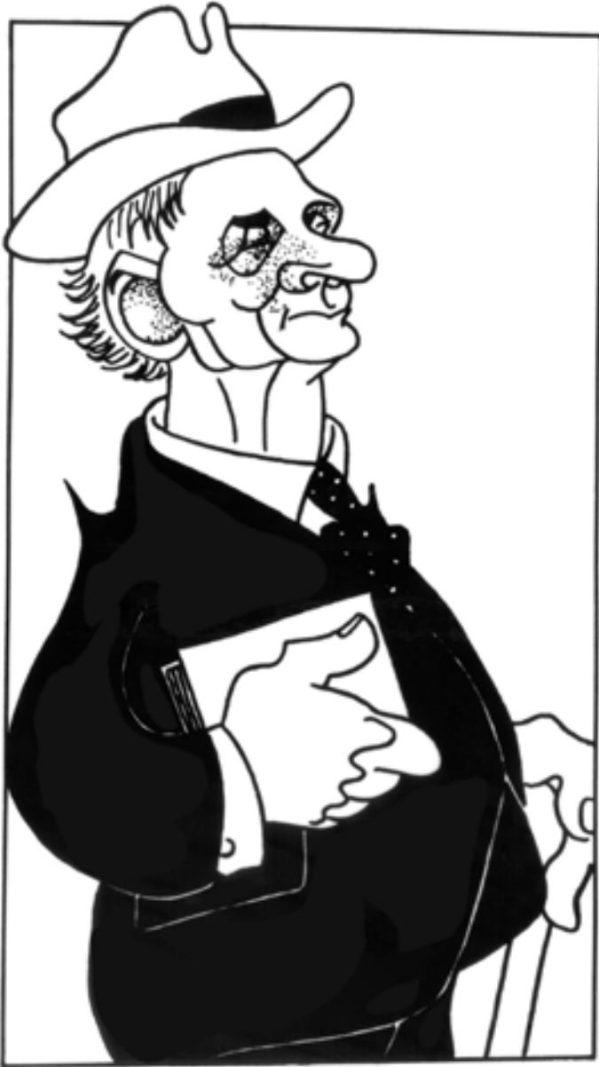
Political Cartoon

Another political champion, Thomas Pryor Gore was elected to the U.S. Senate as one of the first two senators from the new state of Oklahoma. Blind from childhood, Gore served from 1907 until 1921 and from 1931 until 1937.