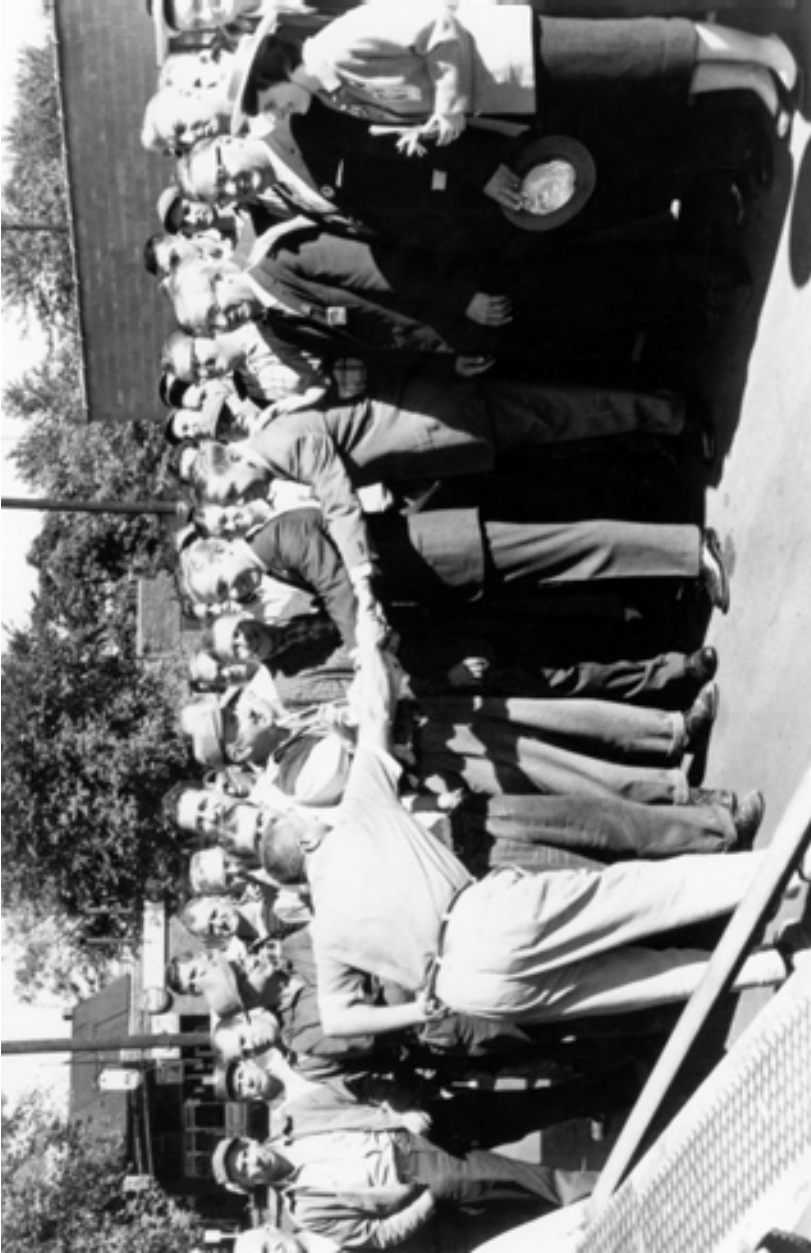
Campaigning for John F. Kennedy in 1960, Governor J. Howard Edmondson (right) shakes hands with a group of Oklahoma City workers.