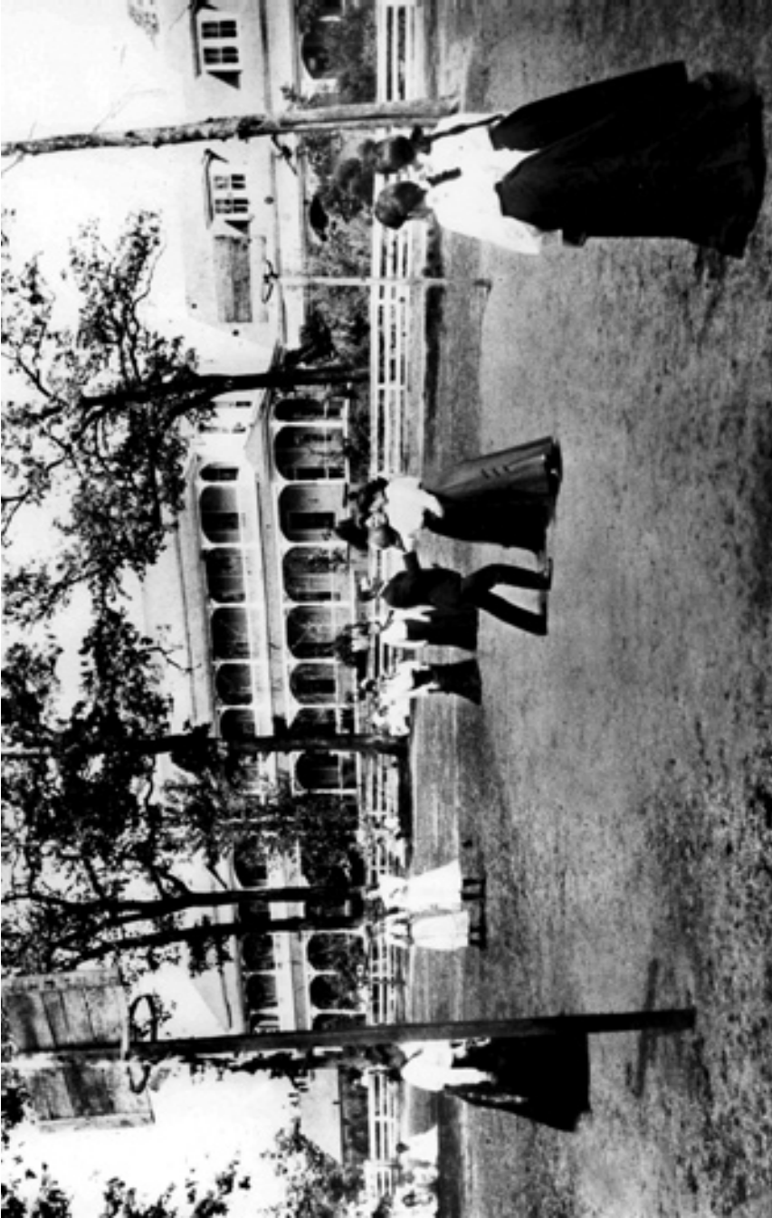
Early basketball at the Bloomfield Academy Chickasaw Girls Seminary. Bloomfield began as an ordinary boarding school started by missionaries, and was later developed into a finishing school with high enough standards to earn graduates prestige. Called by some the "Bryn Mawr of the West," the school grew in stature as the Chickasaw people were determined to obtain excellent education for their children.